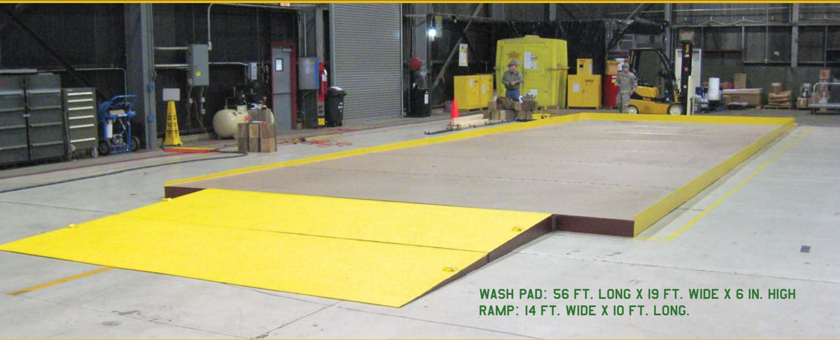
WASH PAD: 56 FT. LONG X 19 FT. WIDE X 6 IN. HIGH RAMP: 14 FT. WIDE X 10 FT. LONG.